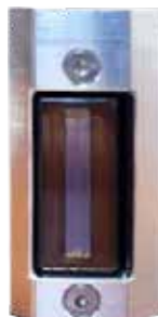
InteliJet L Pc TIJ 4.0 Printhead 22mm width